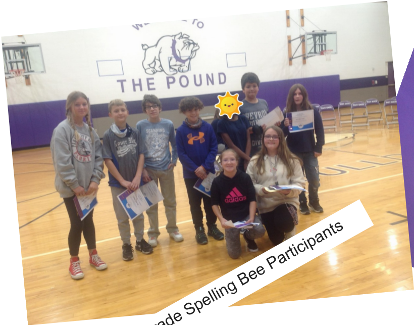
6th Grade Spelling Bee Participants